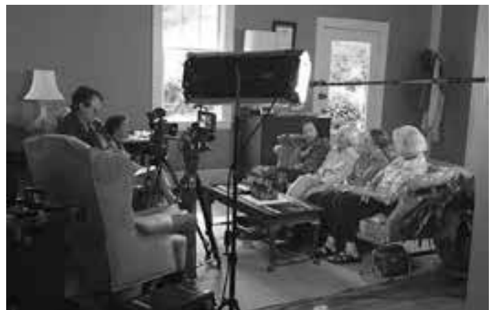
Lights! Camera! Action!

all our participants and to the volunteers whose efforts brought this project to fruition.