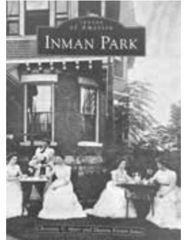
Images of America book on Inman Park