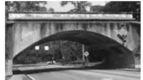
Current view of the bridge entering Druid Hills from Decatur.

to make suggestions or create a master plan for improving the bridge's appearance and maintaining its historic nature. The group hopes to change an ugly duckling into a beautiful swan to welcome motorists and pedestrians to Druid Hills.