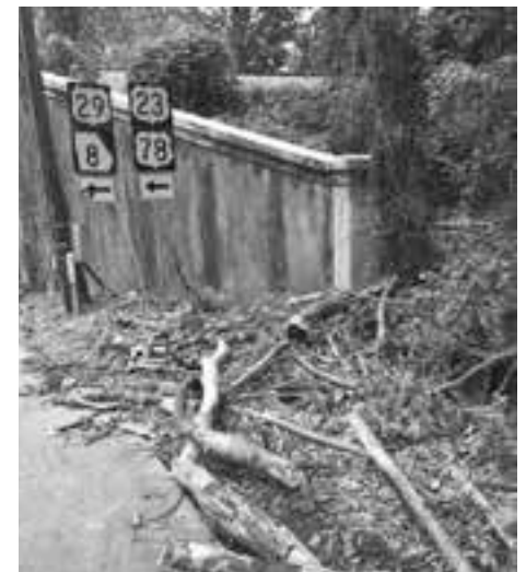
After this photo was taken and shared with CSX and DOT, a lot of the debris was removed.