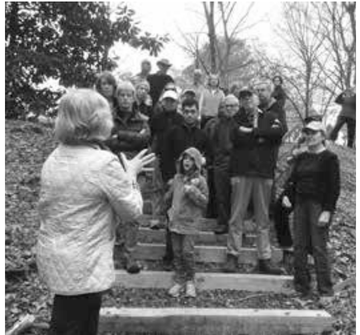
Walking group in Peavine Creek, February 2017

entire trail to the downstream edge of the county park, then up along the old railroad spur. The mulched trail inside the rails was a big hit. We sent thank you messages to the trail author who left the historic rail bed, ties, and rails in place yet provided firm, stable footing. Very cool to see the middle-aged tree growing inside the rails. We checked the likely route of the extended trail loop through the woods and returned to the garden and rainwater harvesting cistern."