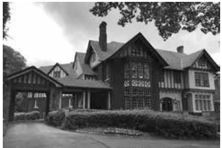
Front elevation of historic Pinebloom mansion, which has recently been put on the “Places in Peril” list by the Georgia Trust For Historic Preservation.