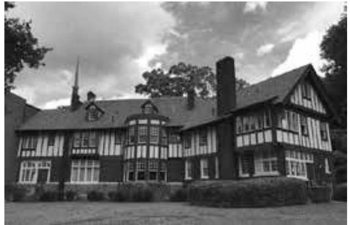
Rear elevation of Pinebloom mansion. A developer has proposed building homes behind the mansion.

The Pinebloom property is one of the last remaining great mansions in Atlanta from the early 20th century, and its loss would be felt throughout the community. However, it could make a great future home for the right owner who values and preserves its historic integrity.