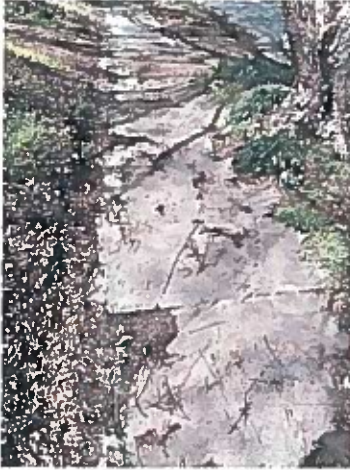
1439 Emory Road