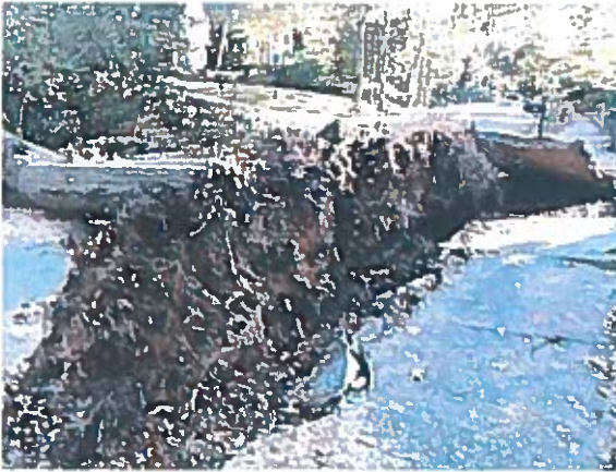
1163 Springdale road