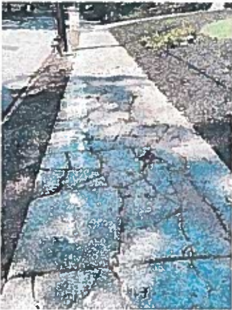
868 Springdale Road