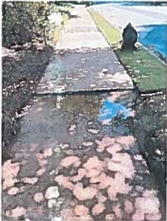
956 Springdale Road