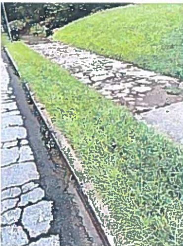
1021 Oakdale Road