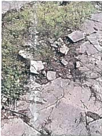
1455 Emory Road