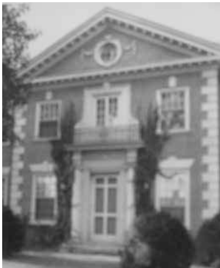
Patillo Woolford House

Adjacent neighbors opposed both applications and had an attorney speak for them at the May hearing in addition to a neighbor-spokesperson. Per LDPC practice, adjacent neighbors are included in on-site visits.