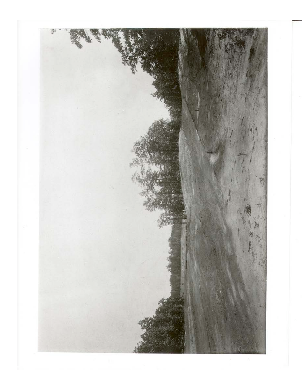
From Moreland Drive by J.C. Olmsted 25th March 1902