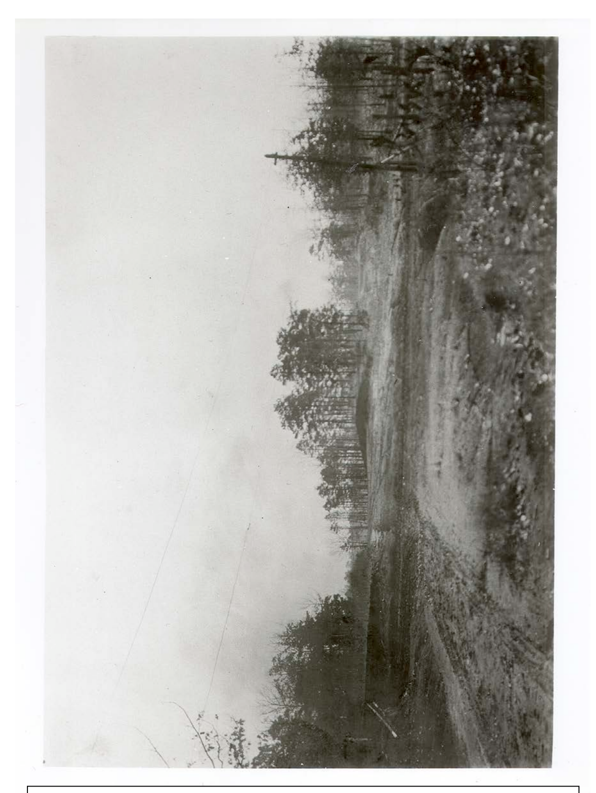
View of Entrance and Parkway from Ponce de Leon Avenue by J.C. Olmsted 9<sup>th</sup> March 1902